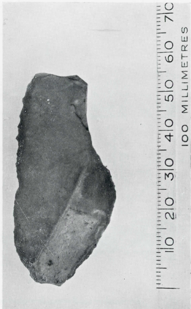
HAYLIE CAIRN. Flint Scraper Knife.