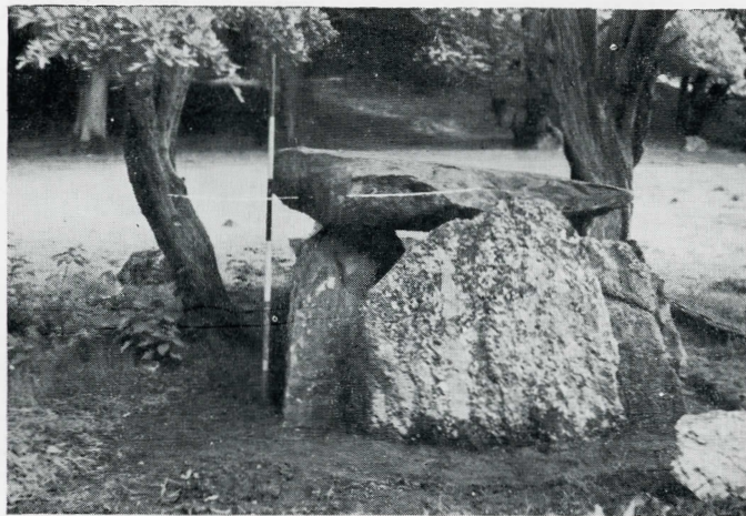
HAYLIE CAIRN. Looking east. W. blocking stone, capstone and ends of N. and S. side stones (before excavation).