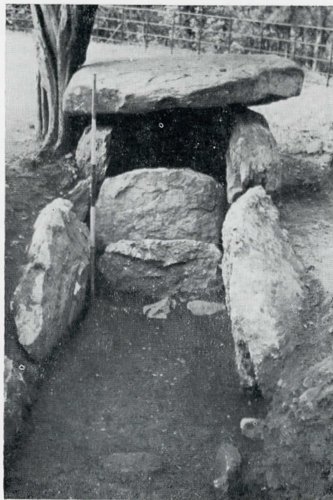
HAYLIE CAIRN. Looking west. Main chamber with capstone. E. ends of N. and S. side stones, septal stone and N. and S. sidestones of 2nd chamber "passage" excavated.