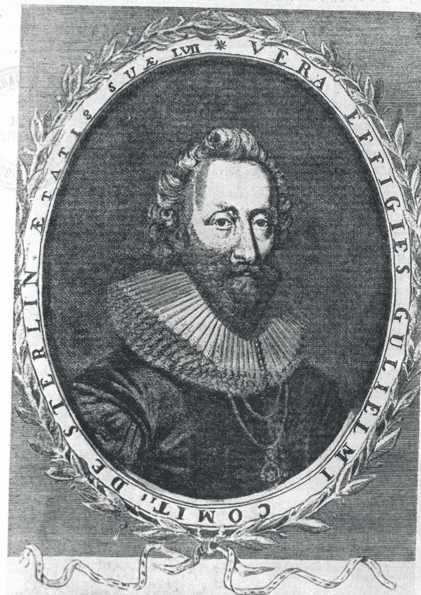
SIR WILLIAM ALEXANDER, EARL OF STIRLING, IN 1624, AGE 57 "Poetical Works" Vols. I, II, in Ayr Carnegie Library